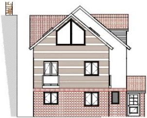
Proposed Left Flank Elevation