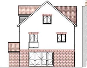
Proposed Right Flank Elevation